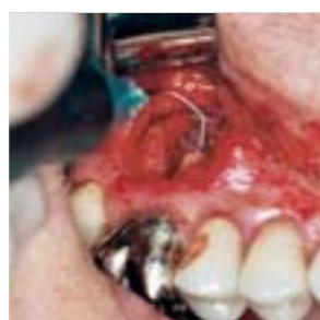
Application example: Apicectomy