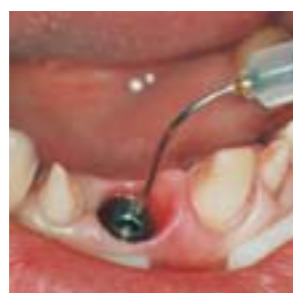
Application example: Implantology