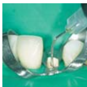
Application example: Endodontics