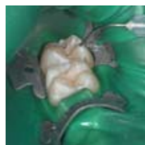
Application example: Adhesive technique