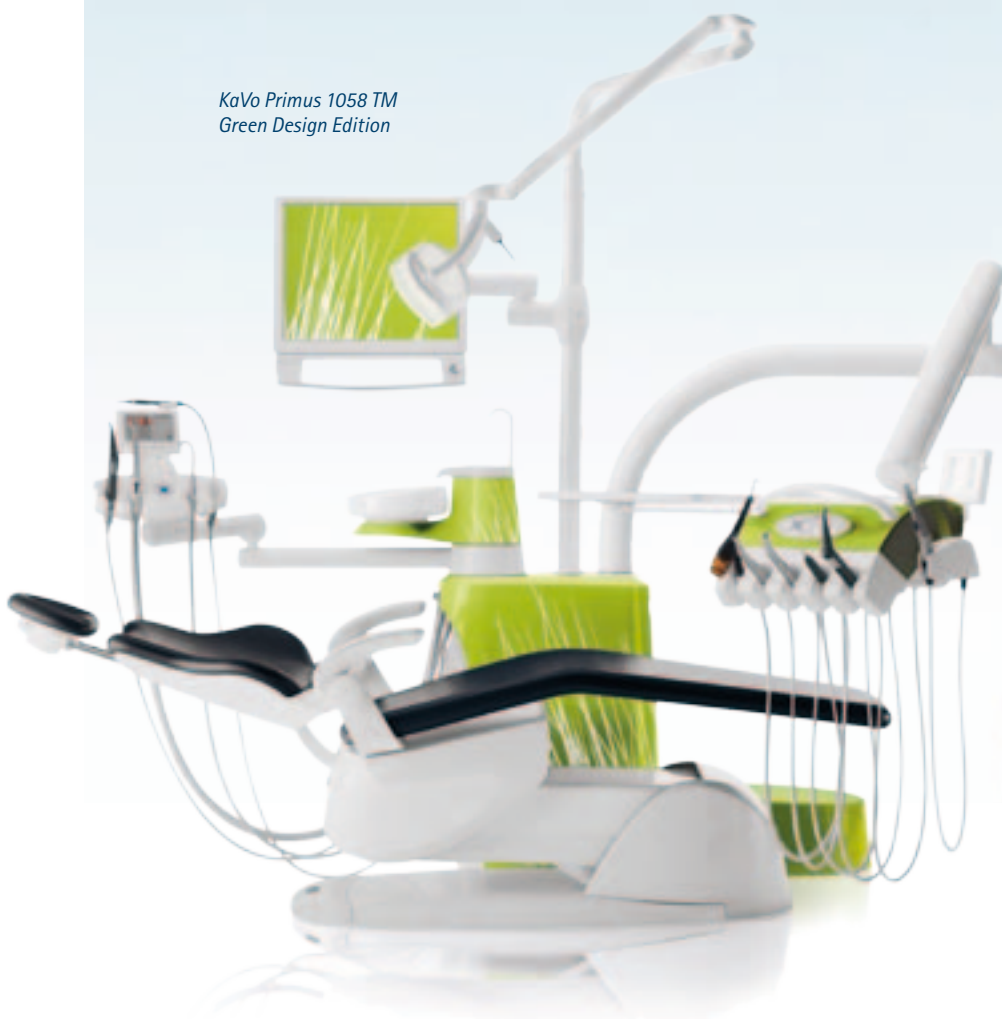
KaVo Primus 1058 TM Green Design Edition